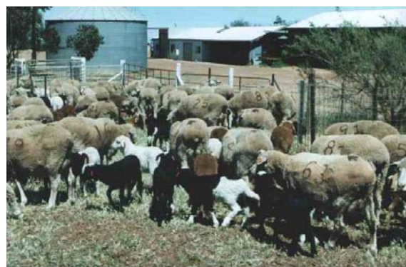
Above: Damara crossbred lambs and Merino ewes