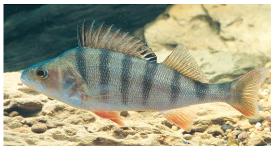
Figure 4. Redfin perch ( Perca fluviatilis )

Since their introduction into Australia during the 1860's redfin perch (Figure 4) have been implicated in the decline of several threatened and non-threatened native fish species (McDowall 1996; Morgan et al. 2002). This impact stems from the species ability to establish large numbers within enclosed water bodies, from their voracious predatory behaviour toward native species, invasive species, fish eggs and invertebrates and from direct competition for available food resources (Lintermans 2007; Lintermans et al. 2007). The combined effects generally result in a severe decline in native species abundance and an alteration in the behaviour and resource utilisation of native prey i.e. native species may be displaced from the relative safety of preferred edge habitats into open water habitat where they are more susceptible to predation (Shirley 2002; Closs et al. 2006). The high abundance and aggressive predatory behaviour of redfin may also result in cascading effects through heavy predation on algal-grazing zooplankton communities which may increase the relative abundance of algae and potentially increase the frequency of algal blooms (Hicks et al. 2007). In addition, redfin may also devastate native fish communities through the transmission of Epizootic Haematopoietic Necrosis Virus (EHNV) (Lintermans 2007; Lintermans et al. 2007).