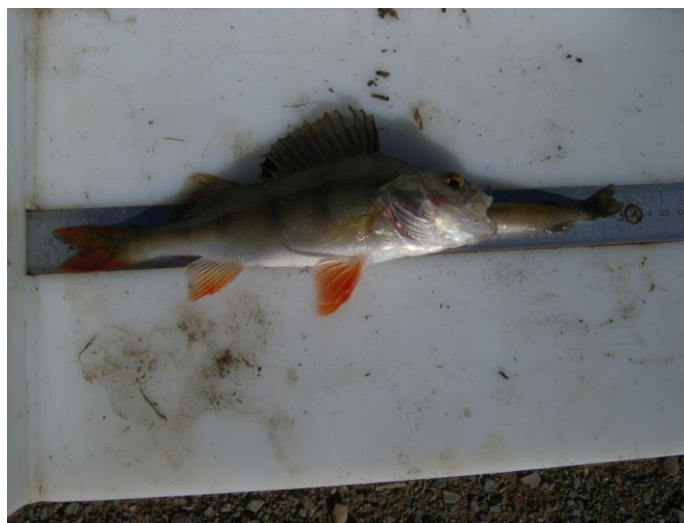
Figure 3. Redfin perch captured within one of the fyke nets with a large common galaxias protruding from its mouth