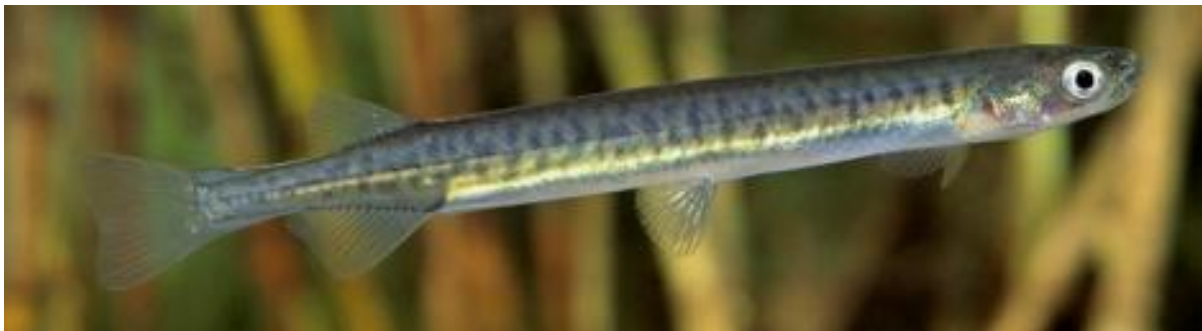
Figure 7. Common galaxias ( Galaxias maculatus )

Common galaxias (Figure 7) is a small-bodied slender fish native to both coastal streams in the Mount Lofty Ranges (MLR) and the Lower River Murray in South Australia. Maximum size is 190 mm TL, however majority are usually < 100 mm TL (Lintermans 2007). Common galaxias life history typically displays that of a diadromous fish species, whereby newly hatched larvae, from eggs deposited in the lower reaches of coastal rivers and streams, are washed into the ocean during winter and spring flows (McDowall 1976; Koehn and O’Conner 1998; McNeil et al. 2009). Larvae develop in the marine environment, before returning en mass as juveniles to recolonise freshwater rivers and streams in the following spring (McNeil et al. 2009). Further growth and adult residence occurs in preferred freshwater habitats, which includes still or slow-flowing streams and margins of lakes, lagoons and wetlands (Lintermans 2007), before downstream spawning migrations to coastal areas in winter and spring (McNeil et al. 2009). Galaxias are carnivorous with a diet consisting of amphipods, microcrustaceans, insects and insect larvae (Lintermans 2007). In both the MLR and the Lower River Murray common galaxias are usually found in high abundance, however, potential threats such as the impedance of fish passage e.g. by weirs and barrages, and predation from voracious predators such as redfin are likely to cause a decline in the overall population.