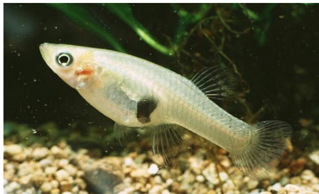
Figure 6. Gambusia ( Gambusia holbrooki )