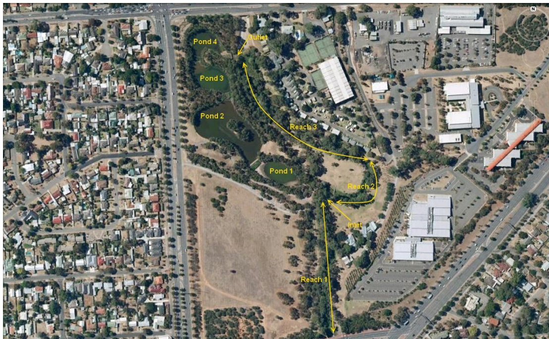
Figure 1. Google earth image of Warriparinga Wetland showing the four ponds and the adjacent Sturt River

Warriparinga Wetland is a constructed wetland located in a 3.5 hectare reserve on the corner of Sturt and Marion Roads, Bedford Park, South Australia (35°1.136'S; 138°33.633'E) (Figure 1). The wetland comprises four vegetated ponds designed to intercept and treat seasonal stormwater overflows from the adjacent Sturt River. Intercepted stormwater is treated during passage and retention via natural processes before being returned to the Sturt River and discharged to sea at the Patawalonga Creek outlet, Glenelg, South Australia. The ponds have a depth \leq 3 m and varying side slopes up to a maximum of 1V:6H. The ponds are able to hold 22,650 m 3 of water when full. The pond arrangement permits linear flow through the wetland from inlet to outlet without any possibility of short circuiting. The pond arrangement and bathymetry provides for distinct inlet, dense emergent macrophyte beds between each pond and open water zones within the system. Emergent macrophytes have also colonised large areas of the shallow littoral zone fringing each pond. Collectively, macrophyte beds occupy approximately 20-40% of the total pond area (WWMMP 2011).