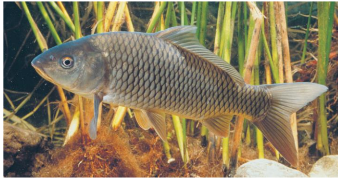
Figure 5. Common carp ( Cyprinus carpio )

While the results of the present survey indicate that carp are in low abundance within the Warriparinga Wetland these catch rates may be a result of the overwintering behaviour of carp i.e. reduced movements or movement back into the main river channel. However, the latter is unlikely at Warriparinga due to the inlet trash rack and the outlet flow control structure suggesting that the few carp within the wetland either washed in as larvae/juveniles or were illegally stocked by recreational anglers. Indeed, one recreational angler reported he had stocked six carp into the wetland within the previous year and that he would restock the wetland beyond draining. The reasons for the nil catch rates of young-of-year carp is unclear as there is sufficient fringing vegetation and suitable water quality for carp spawning and recruitment. Notwithstanding, the high abundance and aggressive predatory behaviour of redfin perch and to a lesser extent gambusia may explain the nil catch rates and this warrants further investigation.